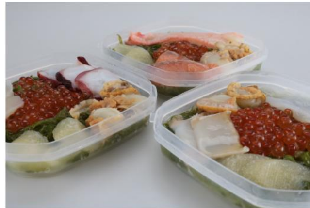
A colorful assortment of sparkling fresh seafood