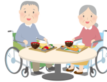
Hospital meals (hospitals nursing facilities)