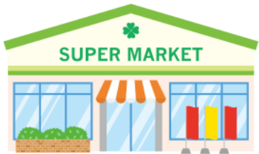
Food supermarkets / mass retailers

Today, our distribution is not limited to supermarkets and restaurants—we also deliver to a wide variety of customers as shown in the illustration below. We also offer OEM supply of frozen processed products such as smoothies and juices. In addition, we accept requests for prep work such as peeling and cutting fresh produce for school lunches and ready-made meals.