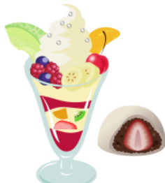
Processors (Western & Japanese confectionery, etc.)