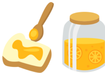
Processors (jam, etc.)