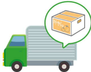
Co-op (delivered by truck)